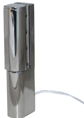
Model No. R51-2000-MRS

Flammability Rating (Wire): VW-1 (UL) and FT1 (CSA)