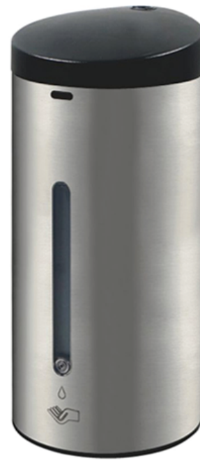
Model No: KS15 - 2020

** Depends on ambient temperature & quality of batteries used