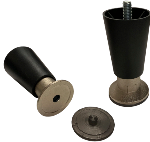
Model No. A70-1020-GL